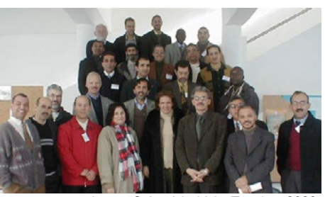
Laser School held in Tangier, 2003, organized by the Optical Society of Morocco.

Looking forward: ICO as an International Organization with entrepreneurial vocation